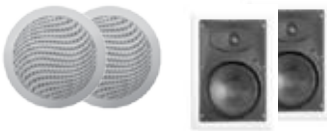
In-Ceiling & Indoor/Outdoor speakers