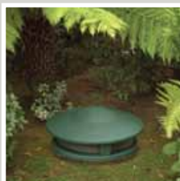
For enhanced bass performance, add the unique Terra AC.SUBe, designed for installation above or partially below ground and a perfect complement to your CA Series loudspeakers.